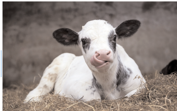
Preventie van luchtweginfecties door NH3 monitoring

The ammonia emissions come from metabolic activities related to bacteria in the livestock farming of poultry, cattle and pigs. Ventilation in the stables must be managed to prevent critical exposure of animals to ammonia which in the long term results in animal stress and inflammation, reduced health and productivity. It is useful to monitor the concentrations of ammonia and to link the measurement signal to the ventilation. Processes can thus be made transparent and the climate is improved fully automatically via the climate computer by controlling the ventilation in the house on the basis of the ammonia concentration. This improves processes and animal welfare. This ultimately results in lower costs and higher quality and production.