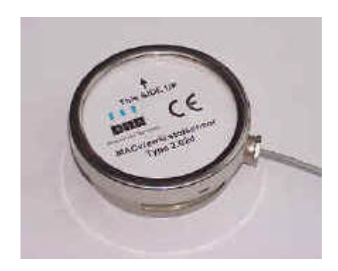
Figure 2 - MAC View®-Particles Sensor 2.02d

Our production process of the MAC View ®-Particles Sensor 2.02d includes calibration of every unit.